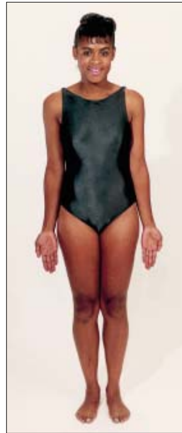
FIGURE 2.13 In the anatomical position, the body is erect, the feet parallel, the eyes directed forward, the arms to the sides with the palms directed forward, and the fingers pointed straight down.